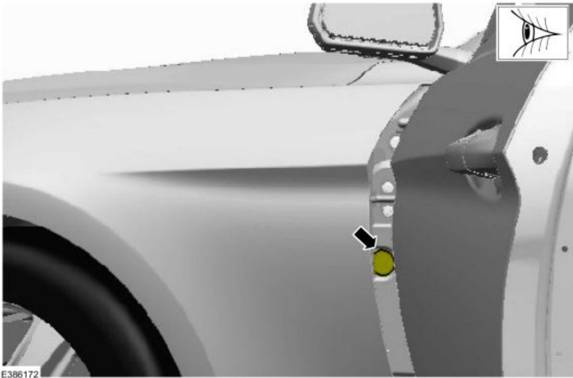
Figure 1 - Left A-pillar shown, right A-pillar similar

NOTE: The A-pillar body seals are an adhesive patch that seals a 19 mm (0.75 in.) diameter hole in the sheet metal. These seals must have complete adhesion around all edges. If any portion of the sealing surface is compromised, water entry into the cabin may result.