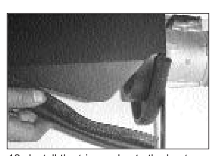
12. Install the trim seal onto the heat shield.