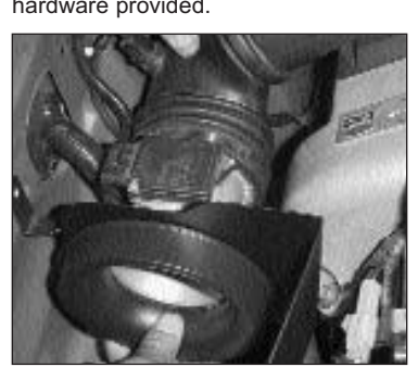
9. Install the mass air assembly into the intake tube.