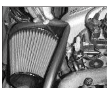
15. Install the filtercharger element onto the adapter and secure it with the hose clamp provided.