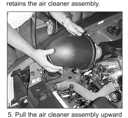
and remove from vehicle.