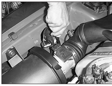
3. Loosen the hose clamp on the intake tube at the mass air sensor.