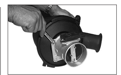
6. Loosen and remove the four nuts that retain the mass-air sensor to the air cleaner.