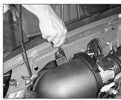
4. Loosen and remove the bolt that