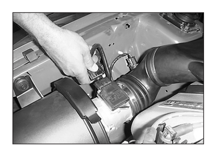
2. Disconnect the mass air sensor electrical connections.

1. Turn the ignition OFF and disconnect the vehicle's negative battery cable.