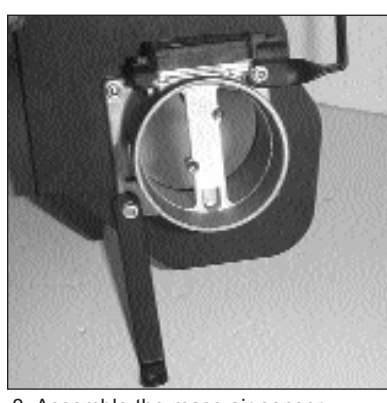
8. Assemble the mass air sensor, adapter, gaskets and brackets using the hardware provided.