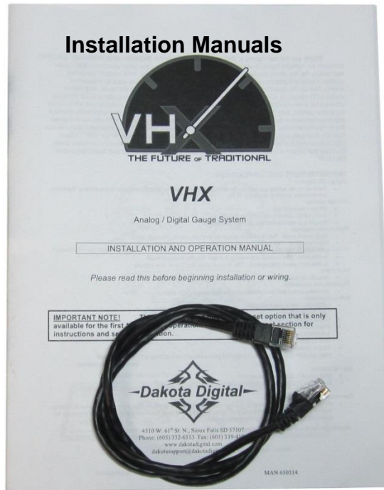
(1) 36" CAT5 Cable