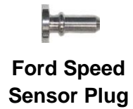
Ford Speed Sensor Plug