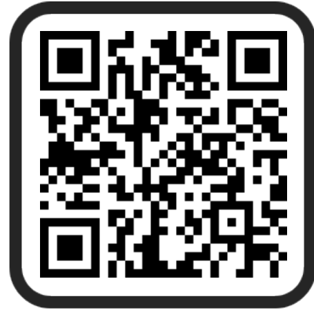
Fox Body Door Handle Removal