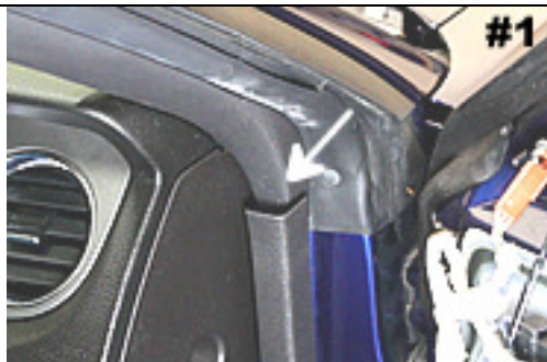
Loosen the trim as shown to remove a-pillar cover.