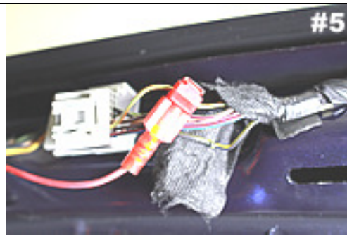
Plug correct wire into the wire tap as indicated in manual.