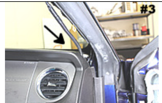
Run wiring/ lamps through gap near a-pillar to passenger side floor.