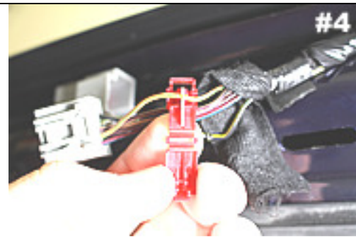
Slide wire into place and close wire tap completely (until it snaps).