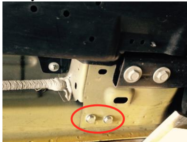
Figure 1: Factory bolts in front of vehicle