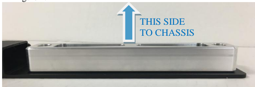
Figure 4: Aluminum spacer block mounting orientation