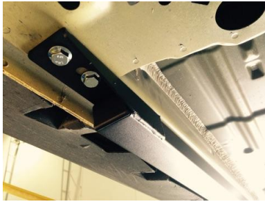
Figure 3: Passenger side jacking rail