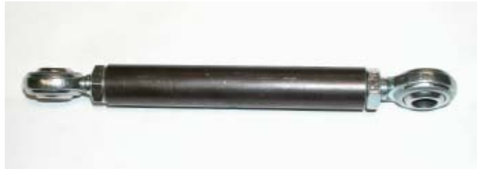
Incorrect- The rod ends are not aligned