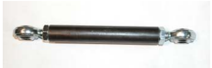
Correct- The rod ends are aligned.

62. Install the Chassis Mount end 5/8" bolt . Use four washers, one on each side of the rod end (inside the mounting bracket), and the other two outside the bracket, one on each side.