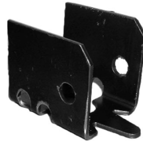
Crush Tube Plates & Tubes