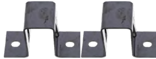
(B) (2) Mid Plates