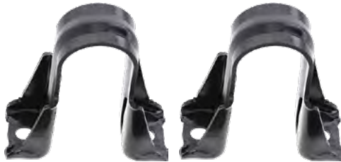
(A) (2) U-Shaped Brackets