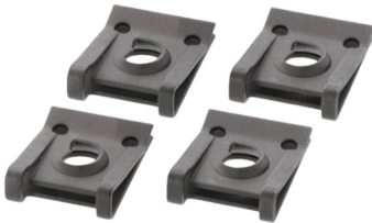
J (4) Hex Head Arm Rest To Door Metal Speed Nuts