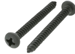
C (2) Door Speaker Screws