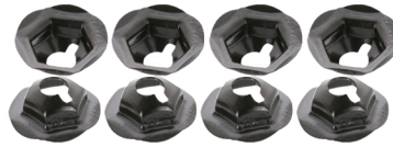
E (8) Door Speaker Pal Nuts