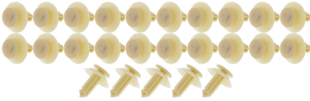
A (25) Door Panel Clips