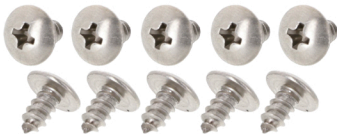
D (10) Door Belt Weather Strip Screws