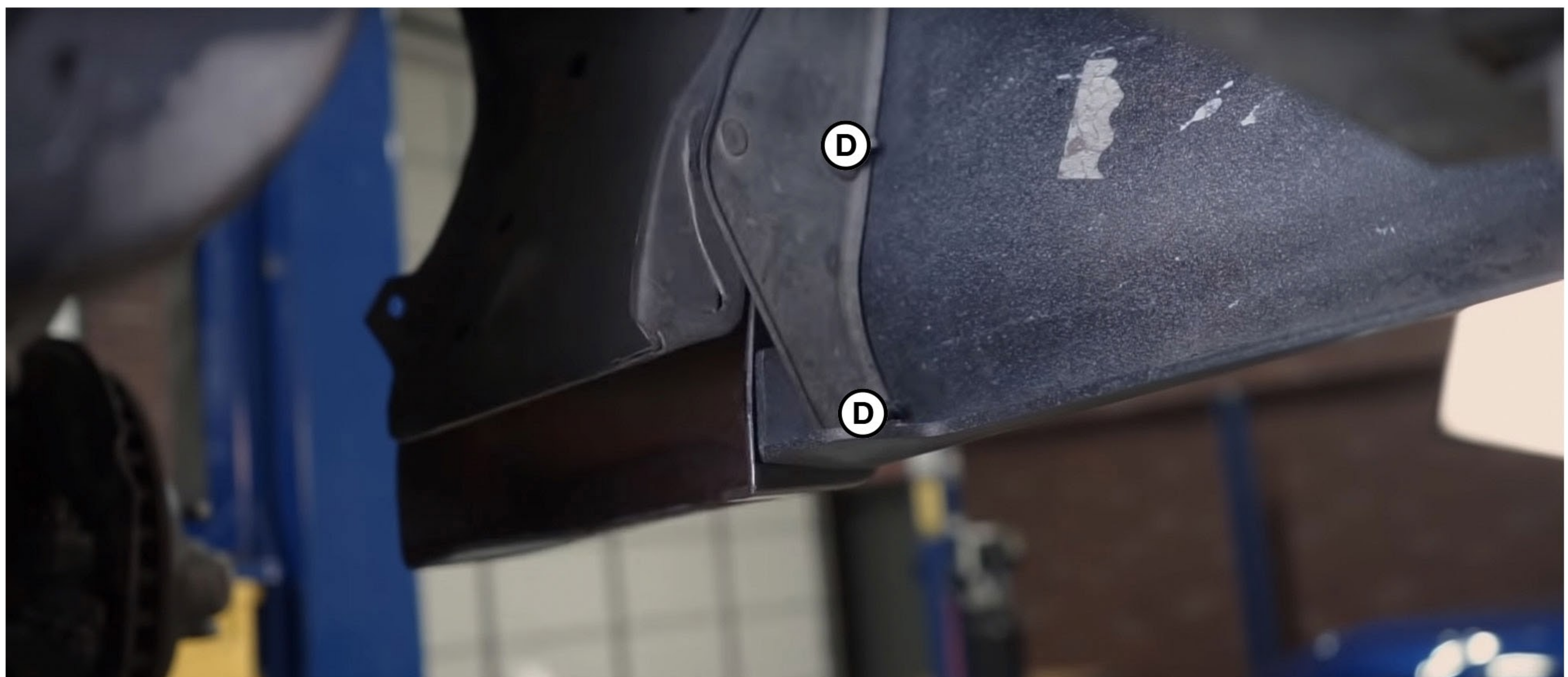
← REAR OF MUSTANG