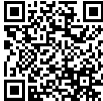
Window Guide Bushing Install