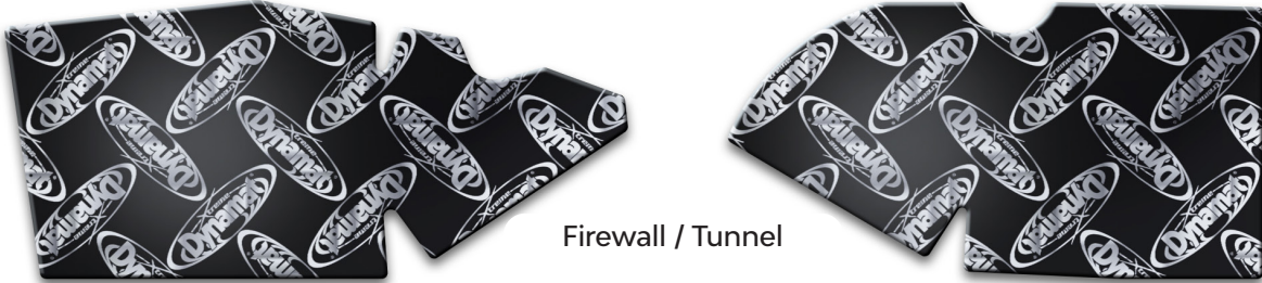
Firewall / Tunnel