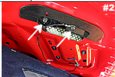
Remove the 2 – 9mm nuts and black retaining plate that secure extractor.