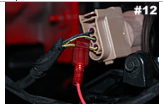
Plug red wire into the wire tap as shown.