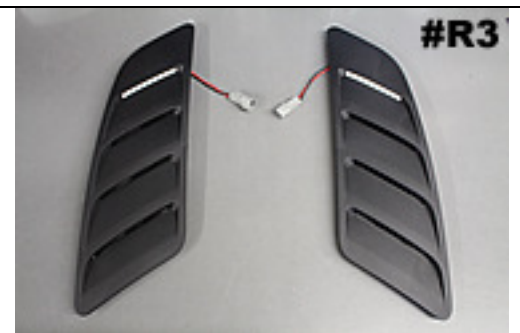
Shown are the lamps once installed. Connectors should be on the inside.