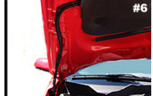
Use zip ties to secure wiring at hood base – follow washer fluid hose.

At this point you want to have a very good idea of where the lamp needs to be placed. In the following steps we will prep the surface and apply an adhesion promotor to ensure a strong bond. Once the bracket is attached, it will be difficult to move so you want to be sure of the placement.