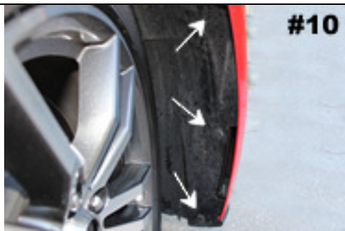
Shown are 3 of the 5 push pins you must remove in the wheel well.