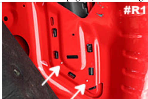
Remove the 2 – T10 Torx screws that help secure each heat extractor.