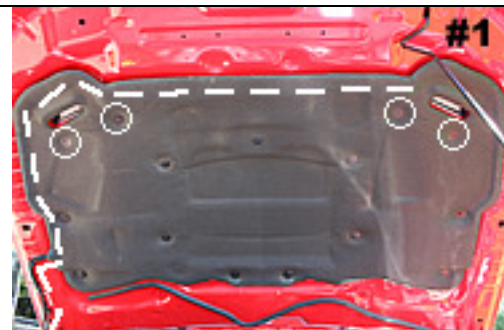
Remove 4 circled pins. Route wiring along dashed line.