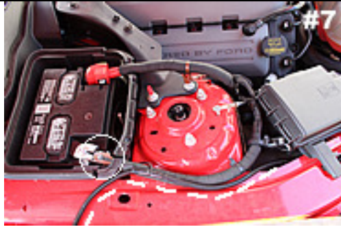
Attach ring terminal to bolt circled above. Re-tighten the bolt.