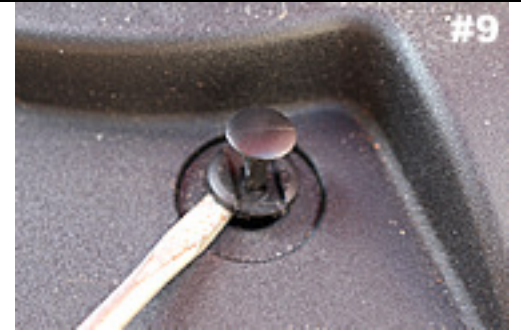
Pry up on center part of pin first. Then pry out entire retainer pin.