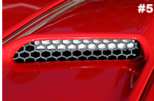
Shown is another view of the lamp after it has been installed.