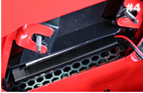
Shown is how the lamp/ bracket will look installed on the heat extractor.