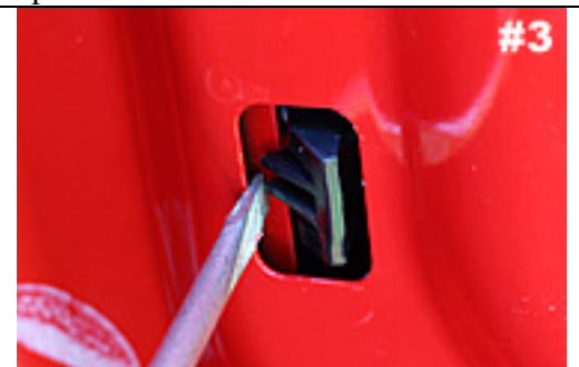
Use a flat head screwdriver to carefully un-clip heat extractors.