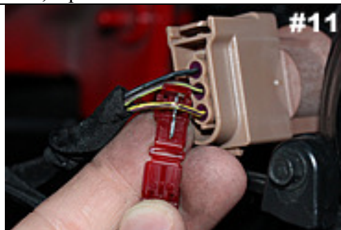
Slide wire into place and close wire tap.