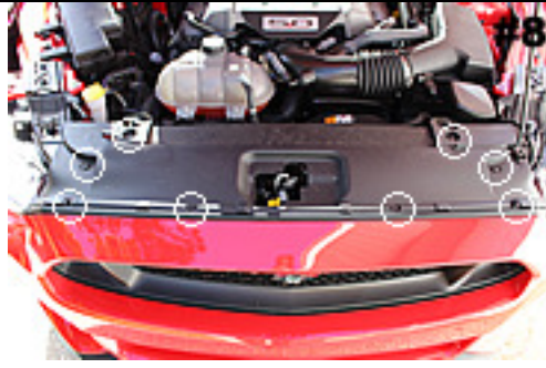
Remove black panel shown. Save 8 retaining pins for re-install later.