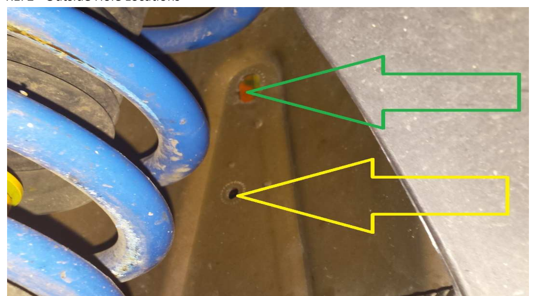
REF3 - Final Assembly